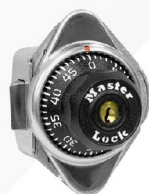
Combination Lock With Key