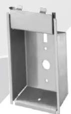
Steel Recessed Cup (Option 2)

NOTE: The optional accessories option states that these items will add an additional price if selected.