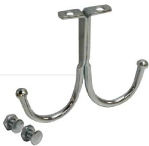
Prong Ceiling Hook