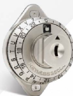
Integrated Lock with Key