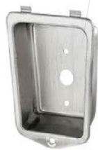
Steel Recessed Cup (Option 1)